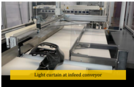
Light curtain at infeed conveyor