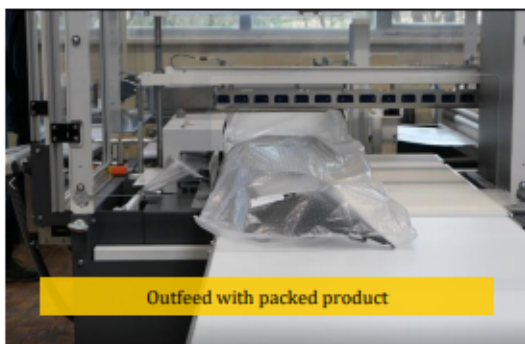
Outfeed with packed product